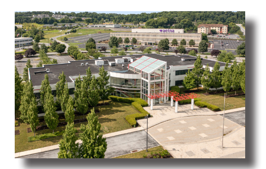
Alderman sold 61,189 SF office building at 3801 Paxton Street in Harrisburg.