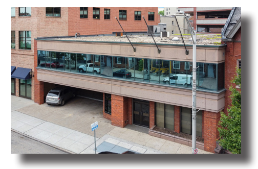
Sgagias & Corbo sold 10,000 SF plus parking garage at 403 N. 2nd Street in Harrisburg.