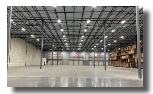
Shepley & Albright leased 48,360 SF at 1700 Harrisburg Pike in Carlisle.