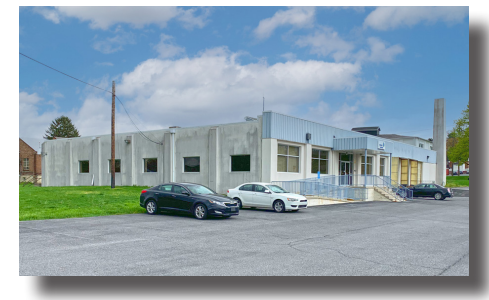
Gladstone sold 17,526 SF at 200 N. Franklin Street in Waynesboro.