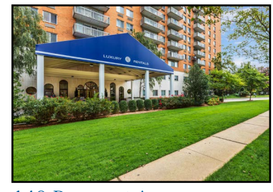
140 Prospect Avenue Hackensack, NJ 7,700 sf for lease Medical Office