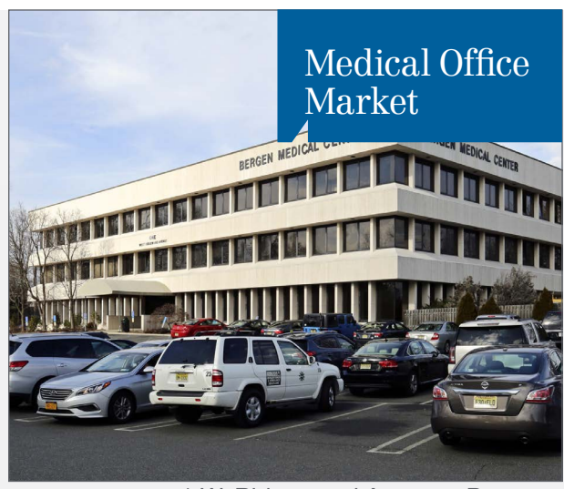
1 W. Ridgewood Avenue., Paramus